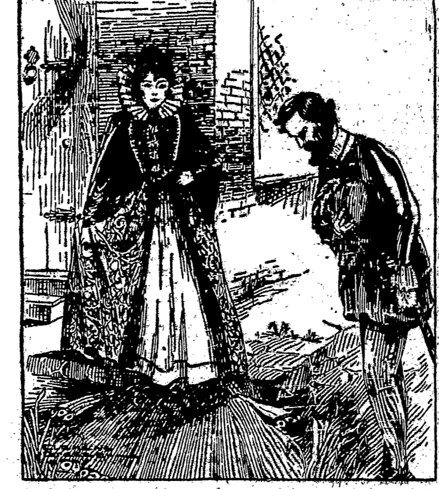
Sir Walter Raleigh and Queen Elizabeth, Raleigh introduced tobacco into England. Can you find a pipe?