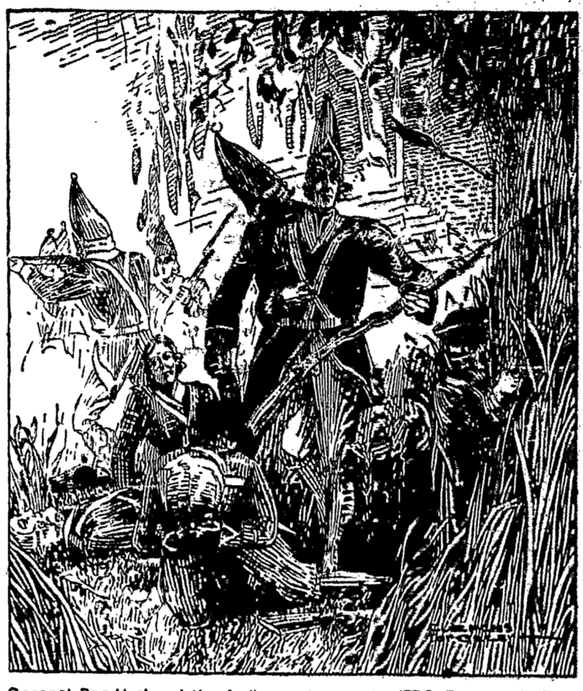
General Braddock and the Indian ambush in 1755. Find two Indians hidden in the illustration.

$6.00 TO BE GIVEN AWAY IN TRADE EACH WEEK TO OUR SUBSCRIBERS By THE CATHOLIC JOURNAL