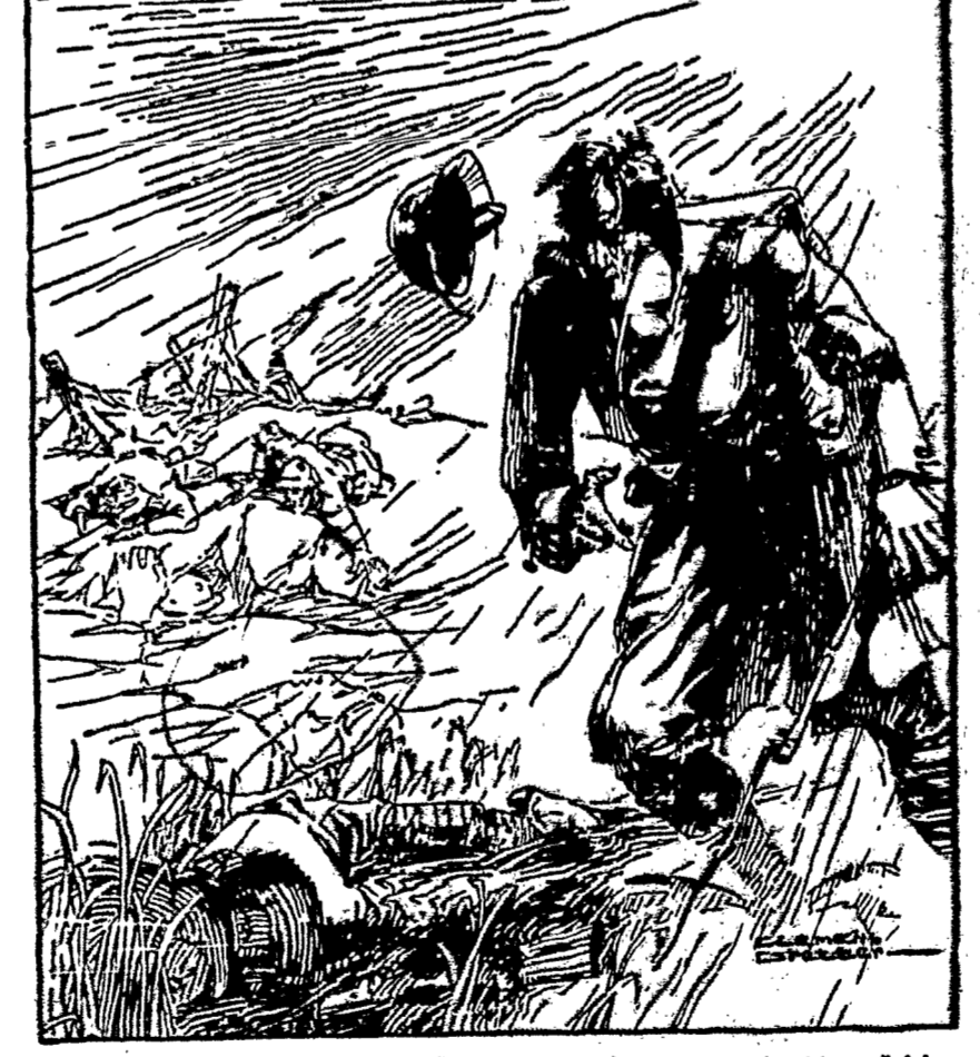
"No Man's Land." As the soldier boy struggles across shell-torn fields, some mother or sweetheart is with him in his thoughts. Can you find her in the picture?