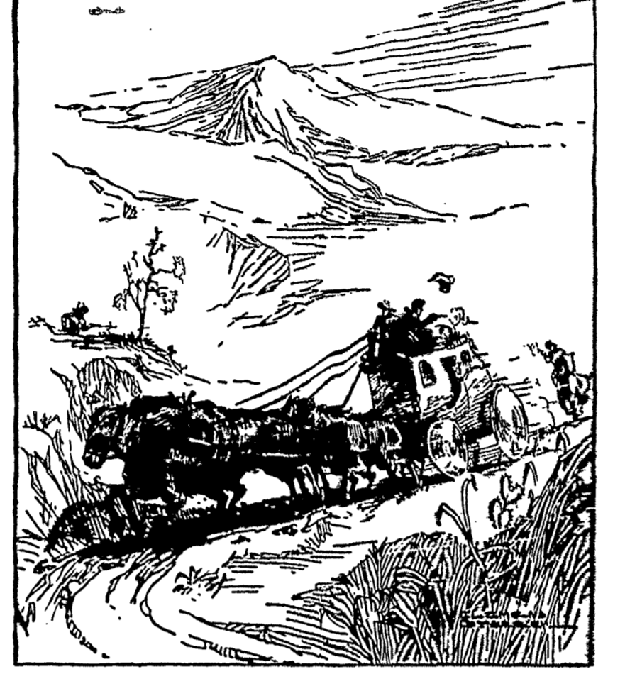
A stage coach hotdip. Find the handle leader.

$6.00 TO BE GIVEN AWAY IN TRADE EACH WEEK TO OUR SUBSCRIBERS By THE CATHOLIC JOURNAL This Page Published Every Friday