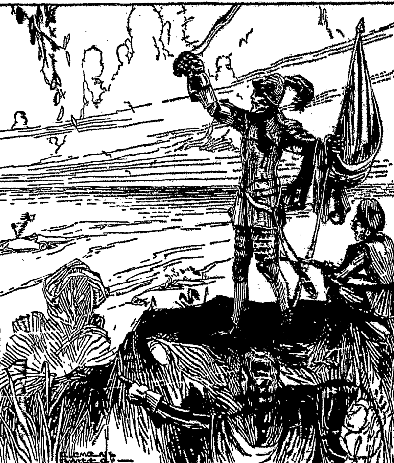
Balboa discovering the Pacific ocean after crossing the Isthmus of Darien in 1513 and claiming it in the name of the king of Spain. Find the man hidden in the picture.

Solve these Pictures on American History Each Week American History Puzzle Picture