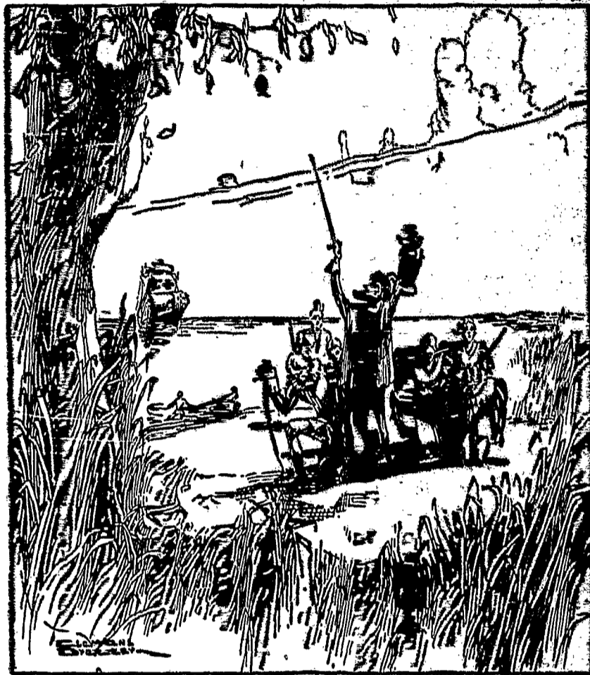
Columbus discovering the New world in 1492. Find a native Indian in the illustration.

Solve these Pictures on American History Each Week American History Puzzle Picture