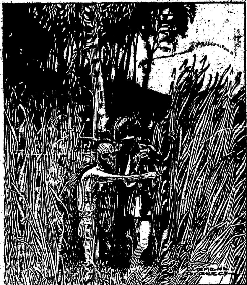
Ponce De Leon looking for the fountain of youth. He discovered and named Florida in 1513. Find the way he imagined himself to be after bathing in the fountain.