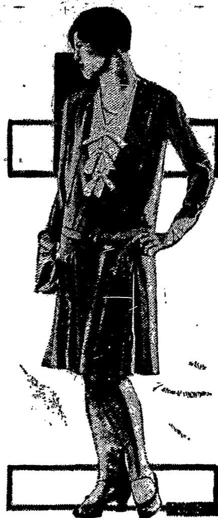
Here is a smart frock for the afternoon tea. Featured are the vestee and puffed cuffs of finely tucked georgette. The material is of crepe de chine.