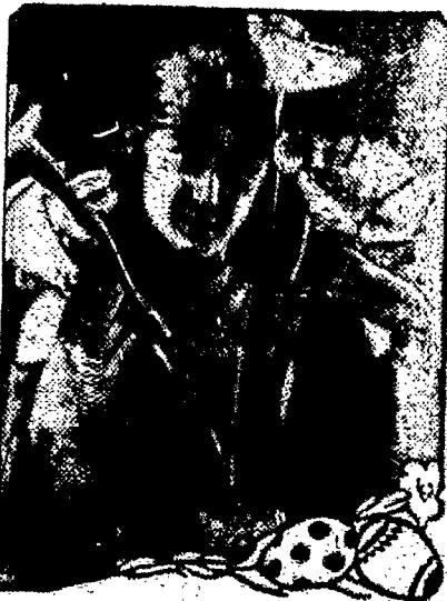
"Dear Lord," the Angels cried, "unshod of sin Around Thy throne we cluster. Should we tell not rather do we spin But we have light and Easter."

gan her year, and so shifted their New Year beginning to Easter and the spring!