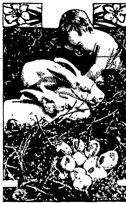
His Easter Find.