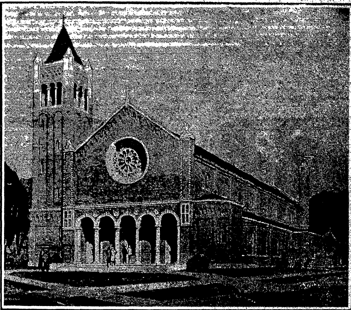
ST. ANDREW'S NEW CHURCH