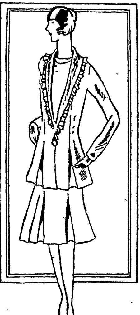
Page Boy Silhouette One of the New Spring Creations.

First in the mode, of course, is the to dark red. They include phantom Black Satin is One Popular Material strictly man-tailored two-piece model red, paris red and "diable" with many vith its scant skirt, straight in line,