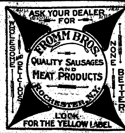
PATRONIZE OUR ADVERTISERS

Branch of Mechanics Bank will be opened at Gas & Electric Bldg., East Ave., about May Ist.