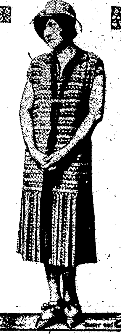
Alternation of Stripes Gives Effect of Two-Piece Costume,

or a mixture, one cupful of sugar, set living, and anything in the way of