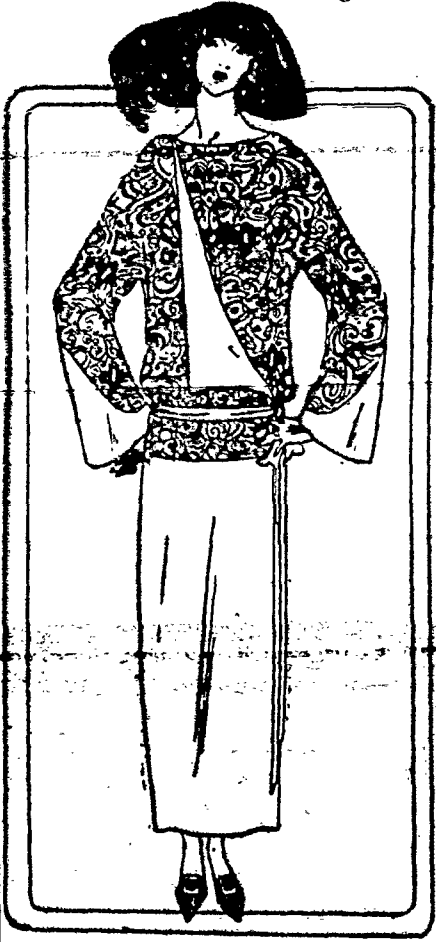
Long, Slim Lines of Mauve Chiffon Draped Over Silver Cloth.

The One-Piece Dresses. There is still a variety of straight, one-piece dresses which will continue in favor. This type of frock is, not made so long as the fuller, flounder ones. It is longer, of course, than those which have been nearer the knees than the ankles, but it does not