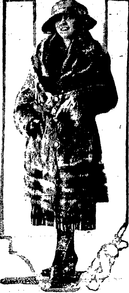
For motoring and under all conditions when durability is required, nothing takes the place of the racoon fur coat.