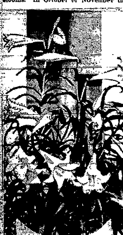
Americani Grown Lilies.

from Washington, department special highest talents propose for them. The ment and later woulder of the claims for immortality accounts for the power that the religion that teaches the immortal hope only one proposed out into small pots, and in Captiling and professions. pricked out into small pots, and in Gentling and pacifying and stimulating the young plants are set in the Gentling and pacifying and stimulating and genius-empowering, the claims the time. "until they told me that the others had taken the examination for plants reach sumcient size to bear motive force in the activities of man-