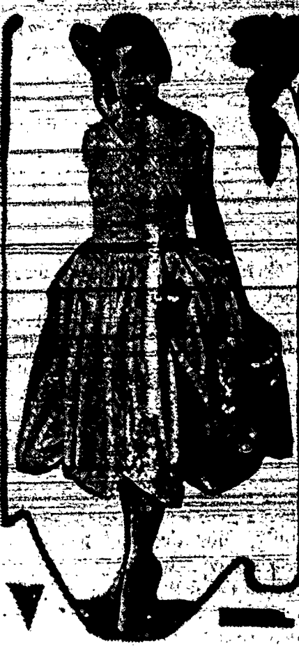
Sauque Waist and Bouffant Skirt.

Accordingly, we see white chosen for the backgrounds of printed designs applied to silks, or embroidered figures carried out in crease fashion to light up white grounds. This was expected. As every one knows, black over shadows all colors in popularity, both for dress and for millinery purposes. Naturally, black brought late prominence striking contrasts evidenced by the adoption of each of the primary colors of blue, red and yellow for combination with black. But for a striking combination with black, white knocks all colors out in the first round. At the spring fashion