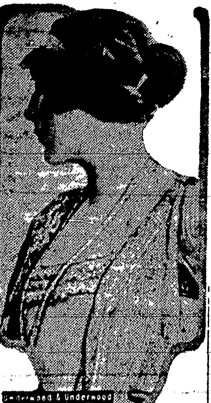
Lady Diana Duff-Cooper, formerly Lady Diana Manners, daughter of the duke and duchess of Rutland...