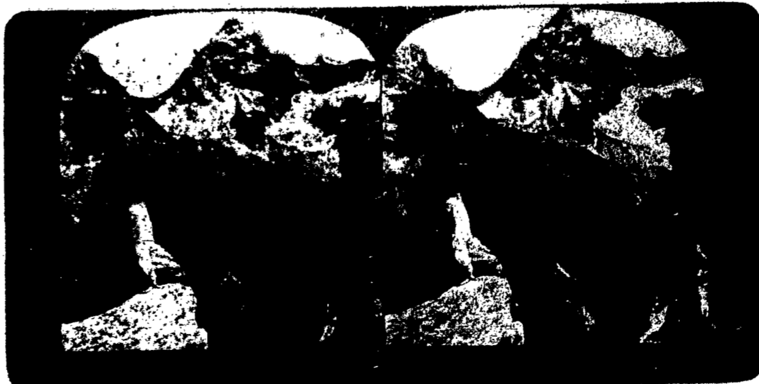
Two-Eyed Vision Gives Perspective, Solidity, Reality

"I wish I could place your slides in all our schools. They are certainly very educational."