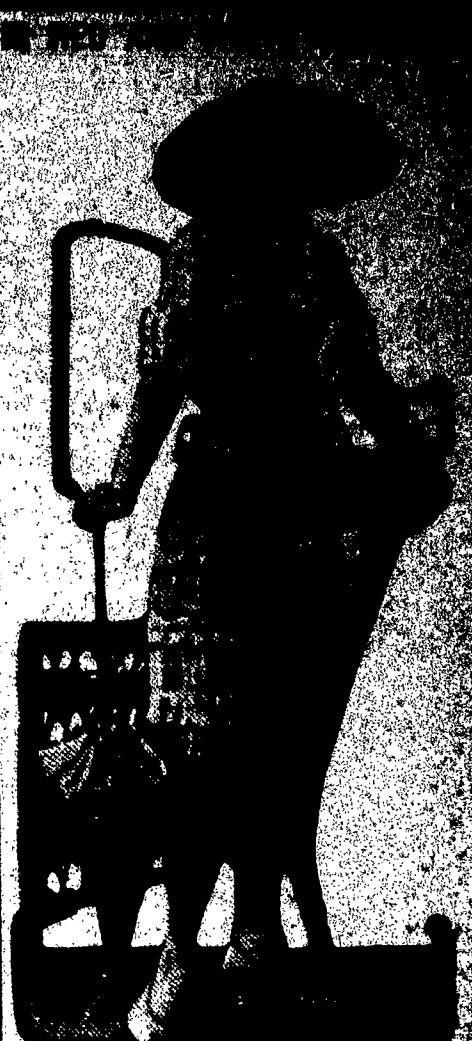
With sufflings of white organdy, this is a delightfully cool and crisp outfit. It is youthful, too.

Parisienne's Bridal Gown. The selection made by one of the most charming Parisienne society girls for her wedding gown: The skirt was short, while the long man-tau de cour was marvelously embroidered in silver thread and bordered with a double row of white lace.