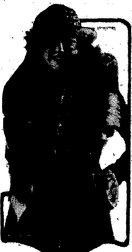
After months of fur coats milady welcomes the spring frock, or one-piece frock, and the becoming fur neck-piece that constitute a really smart spring outfit. This fur is of fox.