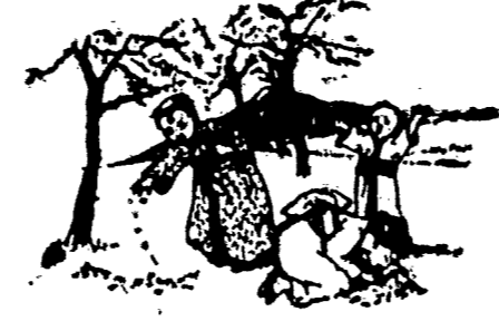
Easter is the Feast of Cherry Blossoms in Japan.

Among the Cherry Blossoms. The great white festival of Shinto is held at Eastertide in Japan, as it heralds the resurrection of Nature from the white-shrouded tomb of winter. Then all Japan goes out rickshaw riding to view the cherry trees, which are laden with lovely blossoms. They line the roadways for miles; no house is too poor to possess several in the tiny garden, and as the sweet spring