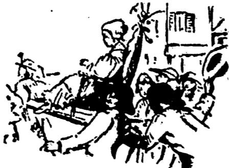
In the South of France Pretty Girls Are Chaired Through the Streets.

In France. During this season in the south of France crowds of young men in holiday attire, and of merry men, parade the streets, carrying chairs lined with white silk and decorated in a lovely fashion with spring flowers and gay