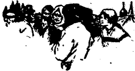
Russian Peasants Salute Each Other on Easter Sunday, Saying: "Christ is Risen!"

In Russia. One cannot help speculating how Easter will be observed this year in this land, where Terror still reigns supreme. In prewar days it was the outstanding event in the year in the lives