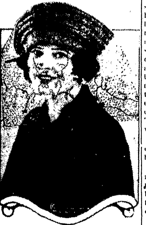
Delightfully springlike in suggestion is this trimmed tailored hat with its loosely draped veil.