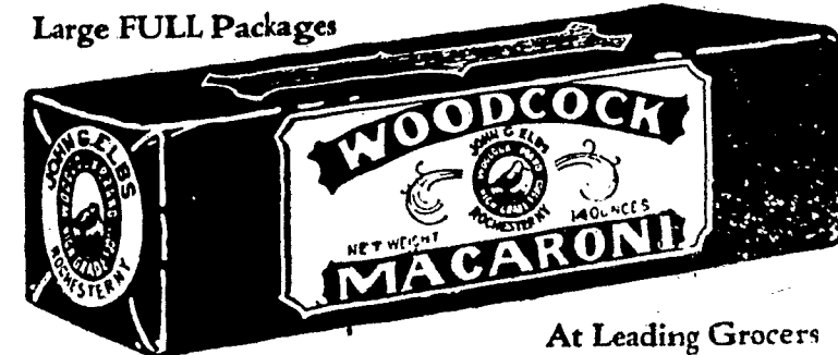
At Leading Grocers