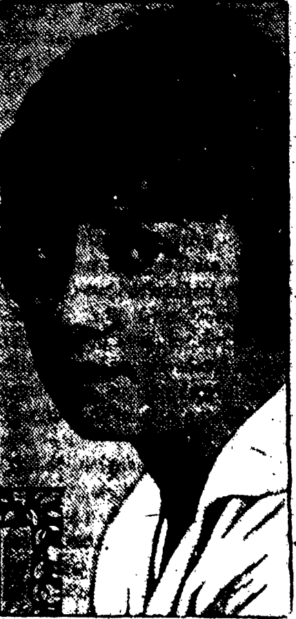
Serious troubles can be removed by expert treatment.

UNDER the head of serious blemishes one should include such things as large birthmarks, smallpox marks, unsightly scars, powder and tattoo marks, and burns.