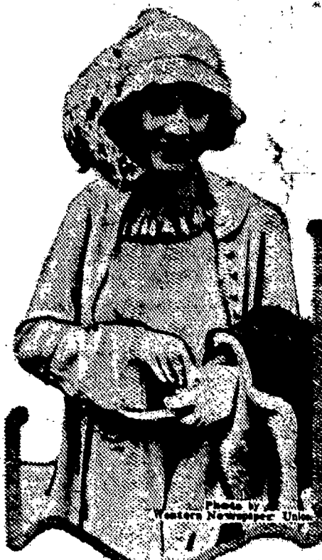
This is Dainty Dorothy Gish, the popular "movie" star, who recently sailed on the "Imperator" for a vacation abroad.