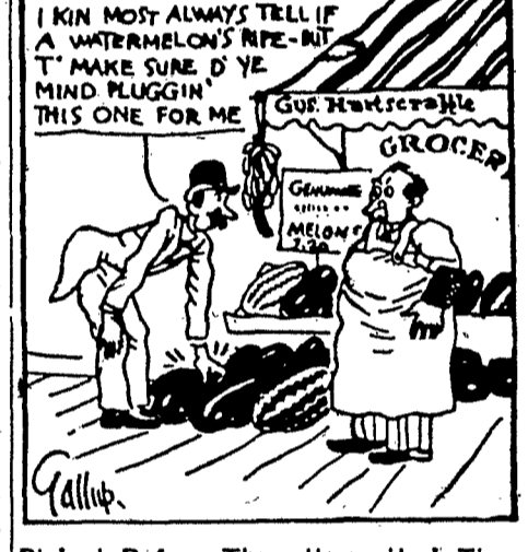
Picked Before They Have Had Time to Get Ripe Anywhere Except on the Surface.

Phone Not an Improvement. Oscar—"Why did you have the telephone taken out of your office?" Jim—"Do you consider anything a modern improvement which gives your wife a chance to ask for money during business hours, after going through your pockets the night before?"—Houston Post.