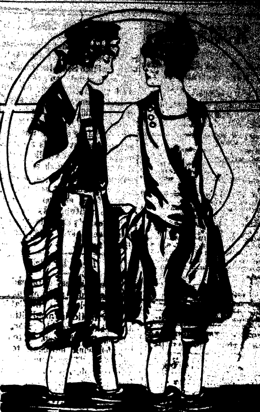
The Newest Styles in Bathing Suits—Swimming Suits, Bathing Suits, Beach and Kinross Suits, Together With Other Seasonable Wear. Are Incorporated in the Oxyph.

An alarm clock which will prove useful to the deaf and also to those whom the ordinary alarm clock fails to arouse has recently been patented.