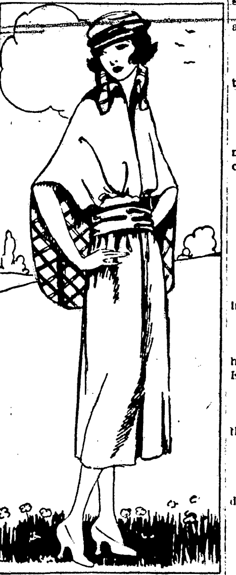
Coat of Blue Serge.

Other plaid wraps, writes a Paris fashion authority, are on the order of the traveling coats beloved by Englishwomen. An interesting one of plaid velours—navy blue, tan and green—is in regulation coat style drawn in slightly at the waistline with a black patent leather belt.