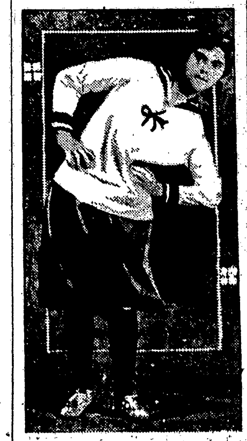
little daily exercise will increase one's beauty and health.

enough of the sort of exercise they dominant note in many of our clothes, water unless the sall b need. One woman to whom I wrote On the Egyptian type of evening broken. Sprinkle the every morning, replied indignantly our, Many of them are absolutely per and let it hang in