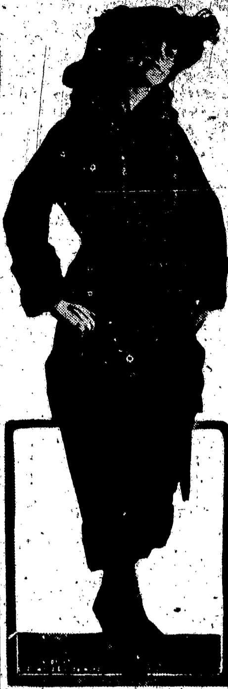
This coat dress of brown duvetyne is very unusual. The shawl collar and bands about the exceedingly short skirt are of sable squirrel.

The newest thing in fashion fades is the headress. Bandeaux of maline and others of fruits and flowers are being worn by debutantes.