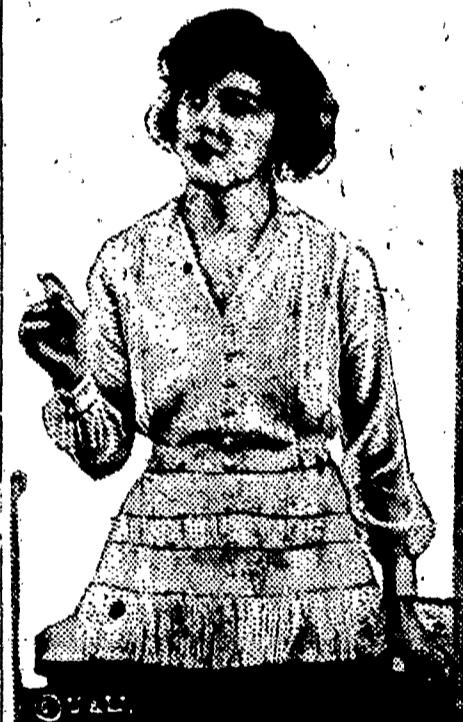
This is a charming blouse of white chiffon with fringe and white silk braid. It is designed with a "V" neck and tight-fitting cuffs.