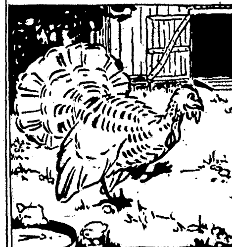
"I Am a Watch Dog."

"I am a turkey," said Timothy Turkey, "but I will not be used for Thanksgiving day dinner, and I will not be used for a Christmas day dinner." "What dinner will you be used for?" asked another turkey. "For no dinner at all," said Timothy Turkey. "What is the trouble?" asked the other turkey. "Are you old and tough?" "Don't be rude," said Timothy Turkey. "The reason I will not be used for any dinner is because I am too famous to be parted with." "They wouldn't part with you if they ate you," said the other turkey. "They would be showing you how they loved you." "You haven't heard my story," said Timothy Turkey. "I believe you're old and tough, and that you wouldn't do for a nice Thanksgiving turkey or for a nice Christmas turkey. That is what I believe." "You are wrong," said Timothy Turkey, "quite, quite, quite wrong. In fact, you are so wrong that I feel sorry for you, quite sorry for you, in fact." "It is pleasant to get so much sympathy," said the other turkey. "You don't mean what you say," said Timothy Turkey. "Tell me your story," said the other turkey, "and stop telling me I don't mean what I say, which in that case I don't, and don't tell me not to be rude when I can't help being rude."