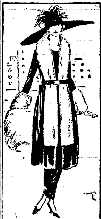
Sapphire blue velvet coat with stole and deep cuffs of beaver.

Wisdom in Buying Gowns. It is no doubt, an actual hardship for a large mass of American women to deny themselves the pleasure of a constant procession of clothes at small prices, but they must economize in this, as in food.