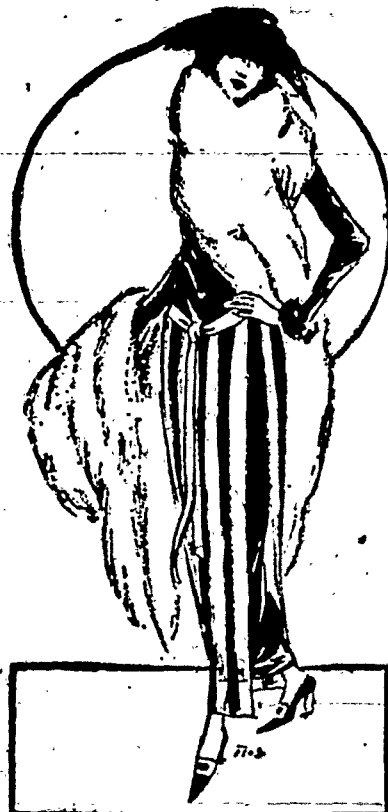
The feature of this black velvet frock is the panels back and front, which are of black and gold gauds and fall below the skirt. The bodice is plain and finished at the neck with fur.

New York.—Wherever merchants are foregathered, writes a fashion correspondent, there is talk, interesting talk, concerning the prices that women pay for clothes this season.