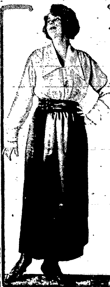
Accordion plaits and panels are very popular this season. This skirt is of a lustrous black satin and the panels are edged with broad silk fringe.