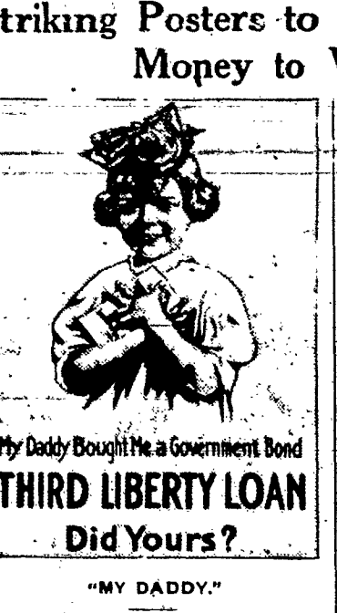
My Daddy Bought Me a Government Bond THIRD LIBERTY LOAN Did Yours? "MY DADDY."