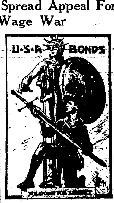
"THE BOY SCOUT POSTER."

The likeness of some little blonde American child, whose identity is not revealed, will appear on a half million posters throughout the country during the coming Third Liberty Loan campaign. She clasps a Liberty Bond in her two hands and proudly proclaims that her "Daddy" has bought her a government security.