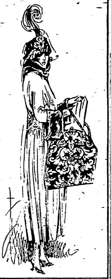
Hat and Bag to Match.

very striking, worn within French blue satin coat with collar and cuffs of soft lustrous moleskin. The wide girle was trimmed with narrow silk braid, and a bit of hand-embroidery, done in blue and gold, was used effectively on the waist.