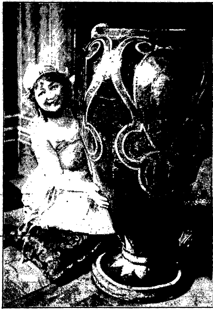
Mabelle Estelle in "Turn Back the Hours" at Avon