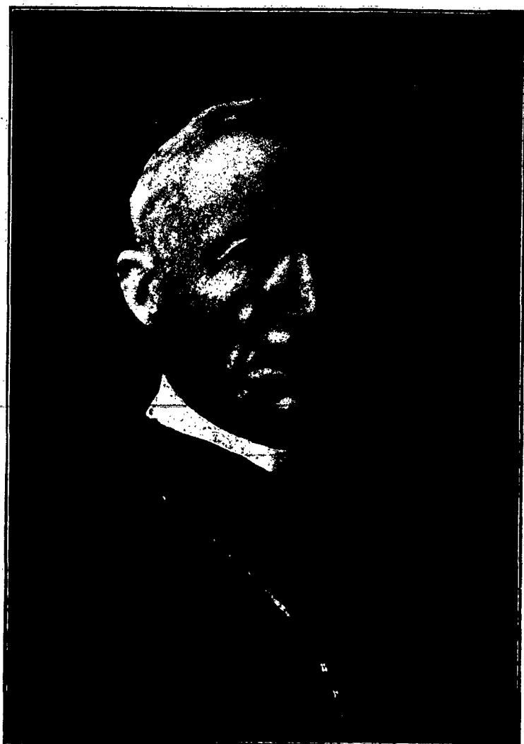
His Eminence James Cardinal Gibbons Dean of the American College of Cardinals Baltimore, Md.

Rochester Stamping Co. Factories and General Offices Rochester, N. Y.