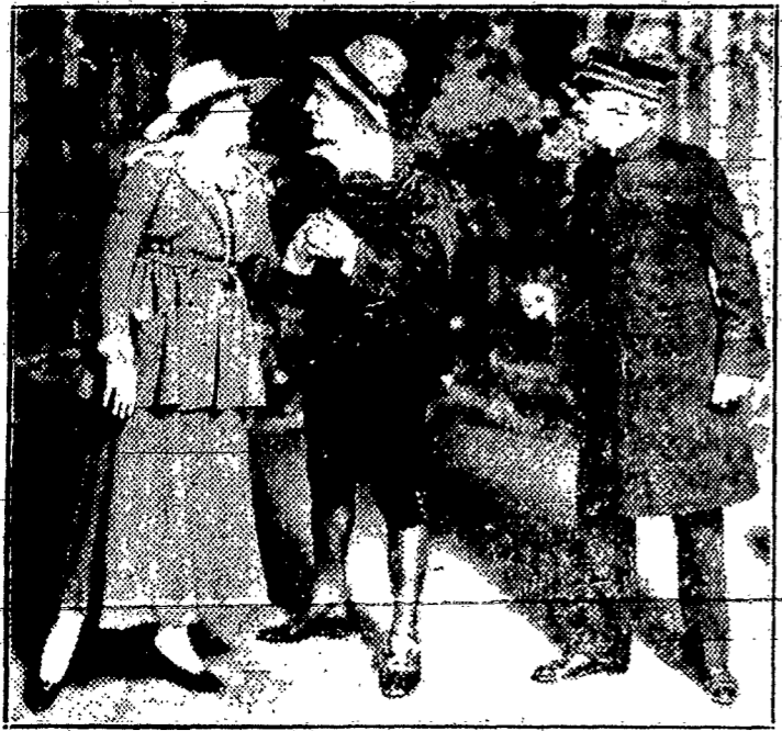
Scene from "Come Back to Erin" at the Avon

Hundreds of Bouquets of Asters and other Flowers for Blessing of the Graves. No high prices. CENTRAL FLORAL AND NURSERY DEPOT The Maurer-Haap Co., 149 Main St. E.