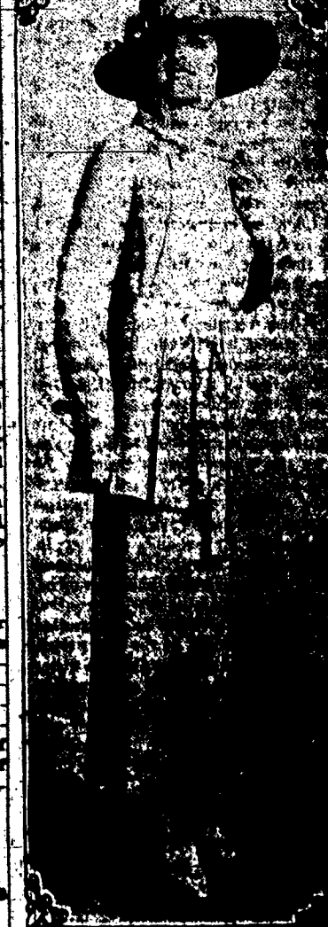
THE TOUTHFUL PROPERTY

The dressy suit of tussore allk is to tured in this gold, green, white or re pink. The coat is plaited back and front, with again belt, convertible care