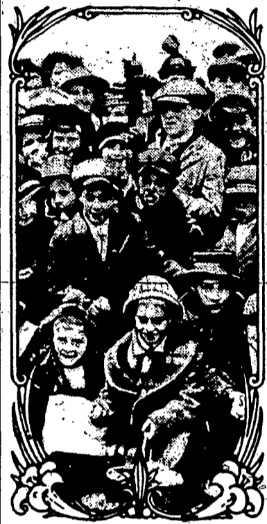
SOME OF THE EGG ROLLERS.

However, there is one day at this smiling season of the year when the president's big back yard is anything but deserted. It is on a Monday, too—Easter Monday, to be exact. Now, you know Monday is "wash day," and in the ordinary household it is the one