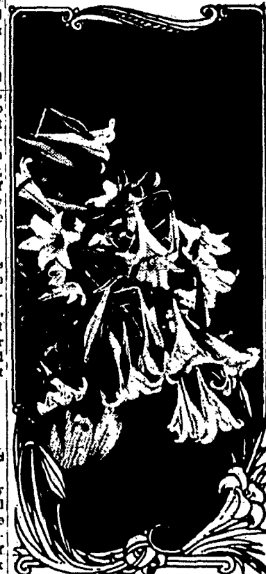
"FLOWER OF PURITY AND SPIRITUAL BEAUTY."

RUSILY dawned the day in the far east. On the shore the cool waves broke gently, fluttering foamy drops on the yellow sand. Away from the water among the rocky stretches of green, lilies bloomed slender and tall, white with cups curving to catch the errant little breeze which carried their sweetness beyond the hills.