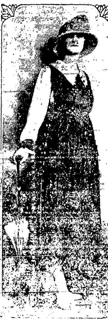
A GIRL'S MODEL

A Girlish Model For High School Graduates.