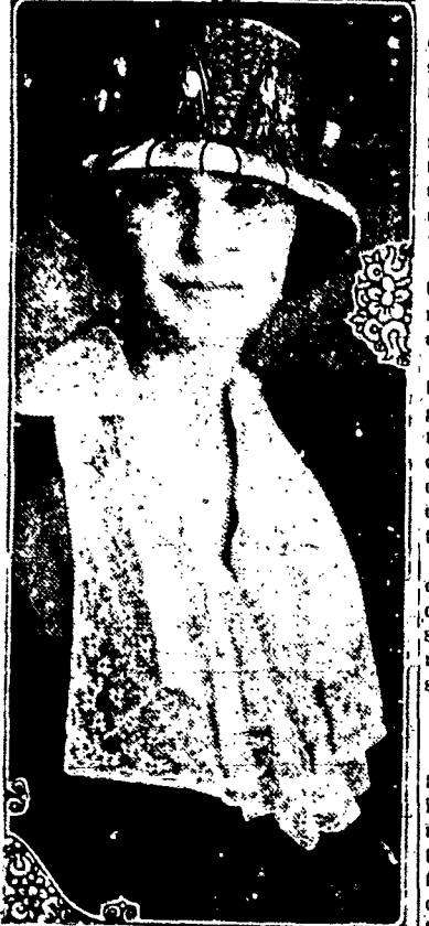
LAKE AND FRILLS

Dainty white, organdy edged with deep val gives this sailor collar and jabot front. Please notice the straw hat.