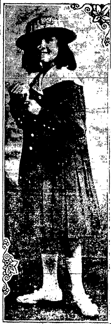
DELIGHTED WITH IT

Topcoat For the Small Girl Who Sheds Her Old One.