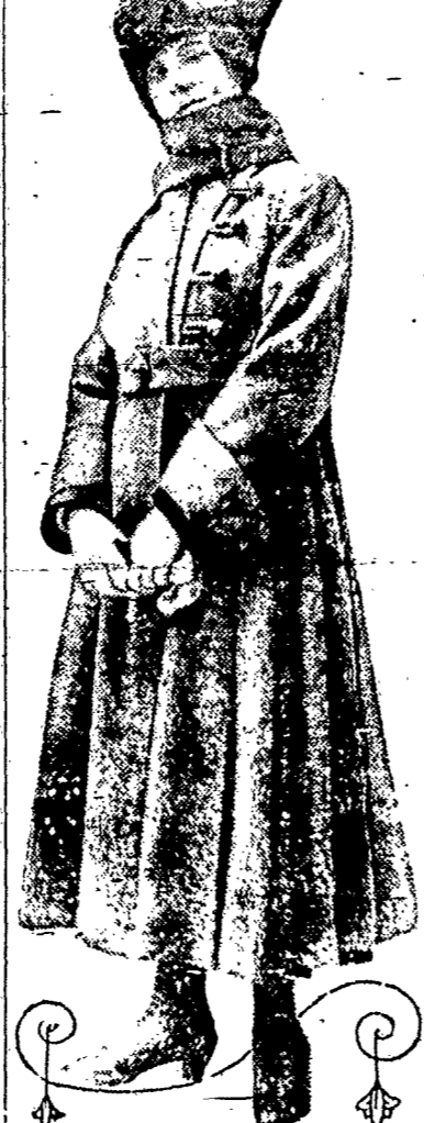
OFF FOR THE BORDER.