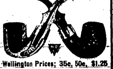
Wellington Prices: 35c, 50c, $1.25

Let us advise you what to give and someone will wonder how you managed to make the selection. Our store holds many suggestions.