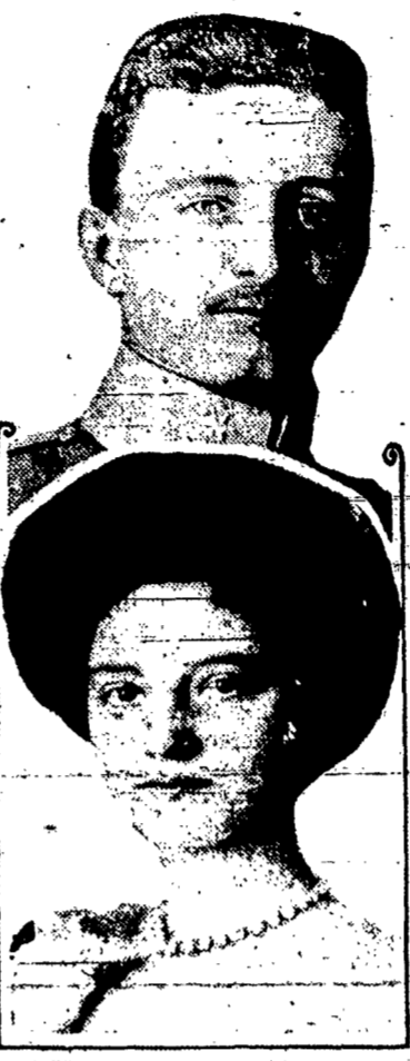
EMPEROR CHARLES I. OF AUSTRIA AND EMPIRESS ZITA.

Charles I. is the title of the new emperor of Austria and king of Hungary. Before his elevation to the throne he was Archduke Charles Francis Joseph and a grandnephew of the late emperor. He is twenty-nine years