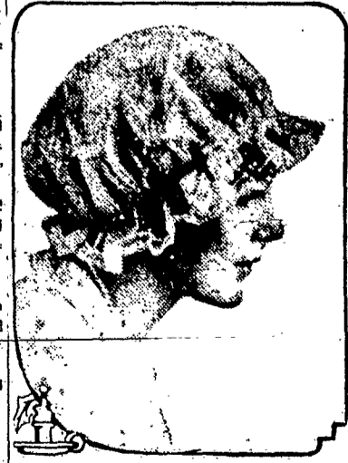
GOOD TO LOOK AT