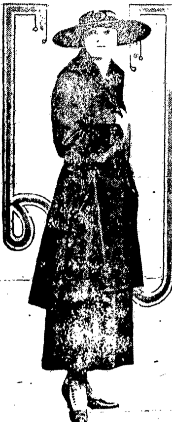
FOR THE HOLIDAYS

Dark green... for this smart suit... collar, pocket lids and cuffs.