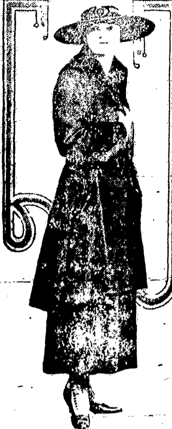
FOR THE HOLIDAYS

Dark green... for this smart suit... collar, pocket lids and cuffs.