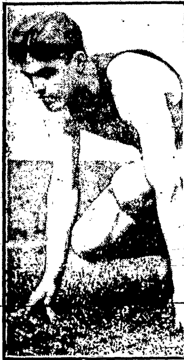
TED MEREDITH.

Our Athletes in Sweden. Officials of the A. A. U. expressed great gratification over the outcome of athletic contests in Sweden...