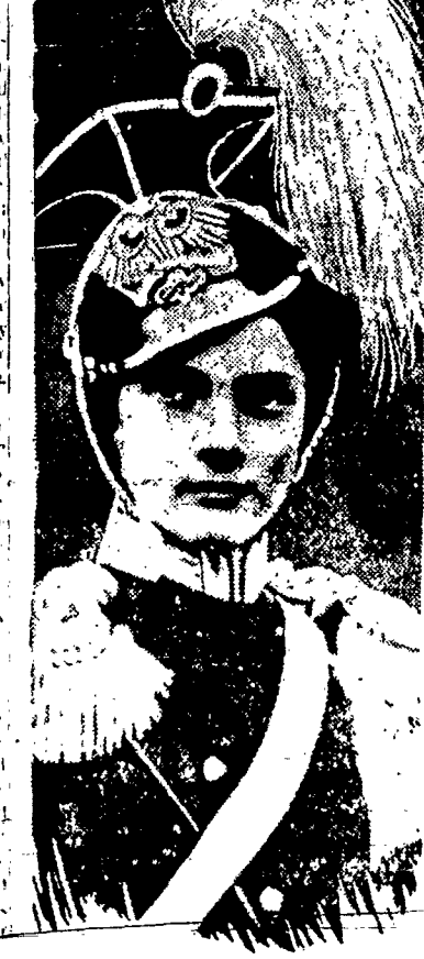
GRAND DUCHESS OLGA OF RUSSIA.

The Grand Duchess Olga, eldest of the four daughters of the czar of Russia, is also considered the most beautiful of the four.