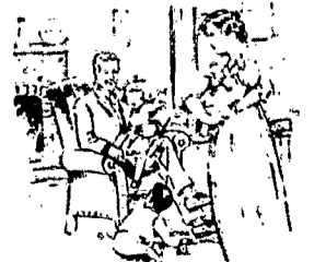
A Safe Family Remedy