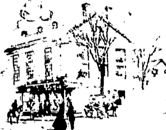
The Old Drug Store

As a guarantee that all of the facts regarding the origin of Father John's Medicine, as stated above, are absolutely true, the manufacturers of Father John's Medicine will give $25,000.00 to any charity, if it can be shown otherwise.