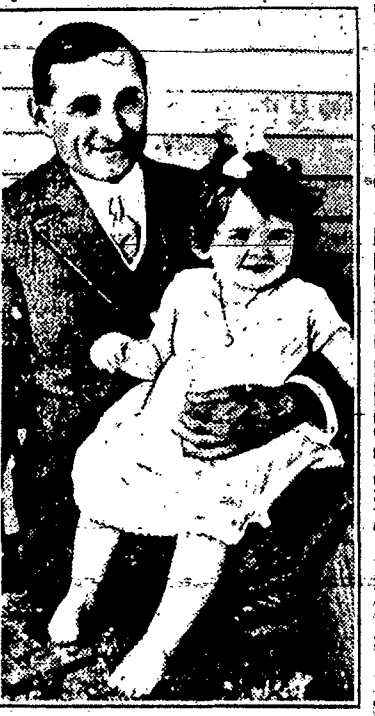
William G. McAdoo and his daughter.

Secretary McAdoo and his daughter. The daughter is now fifteen months of age and is a question has just been sent to all of now fifteen months of age and is a