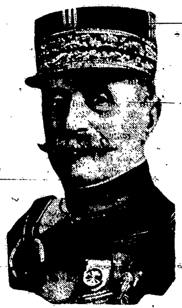
GENERAL FERDINAND FOCH.