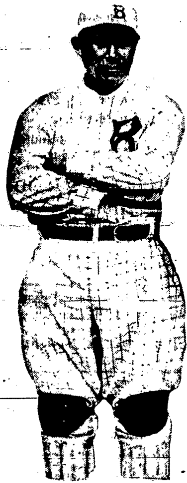
JOHN T. MEYERS.

Chief Meyers, Brooklyn Backstop. John Torres Meyers, familiarly known as "Chief," has fooled the wise ones. McGraw of the New York Giants thought that the oil warrior's big league days were over. Last year he was released and was apparently pointed for the bush leagues, when...