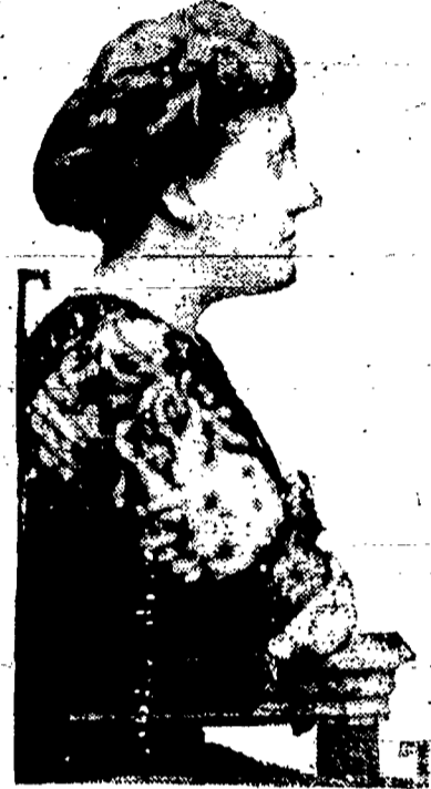
MARY ROBERTS RINEHART.

When the editor sent four women correspondents to the front, he cause he believed that the big story of a war is never at the front, but in the hospitals and in the homes, that war is merely a woman's affair, and woman, I think, best understand the little things that go to make up the big story." Mary Roberts Rinehart, trained