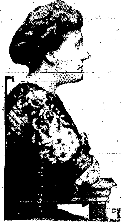
MARY ROBERTS RINEHART.

When the editor sent four women correspondents to the front, he cause he believed that the big story of a war is never at the front, but in the hospitals and in the homes, that war is merely a woman's affair, and woman, I think, best understand the little things that go to make up the big story." Mary Roberts Rinehart, trained