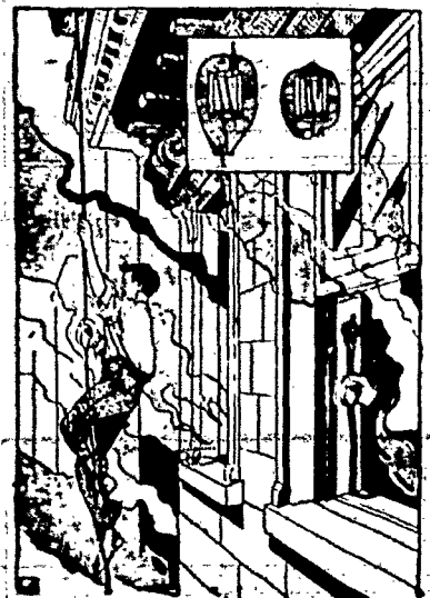
FIRE ESCAPE USER HOLDS TO PULLEY TO DANGLE DOWN BELOW.