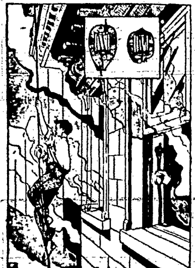
FIRE ESCAPE USER HOLDS TO PULLEY TO DANGLE DOWN BELOW.