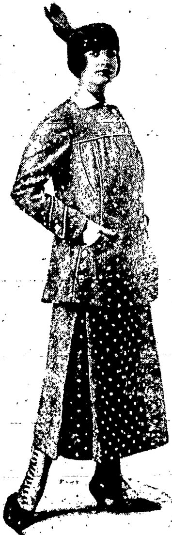
A 1918 MODEL.

For Young Ladies Is This Smart Suit of Towing.