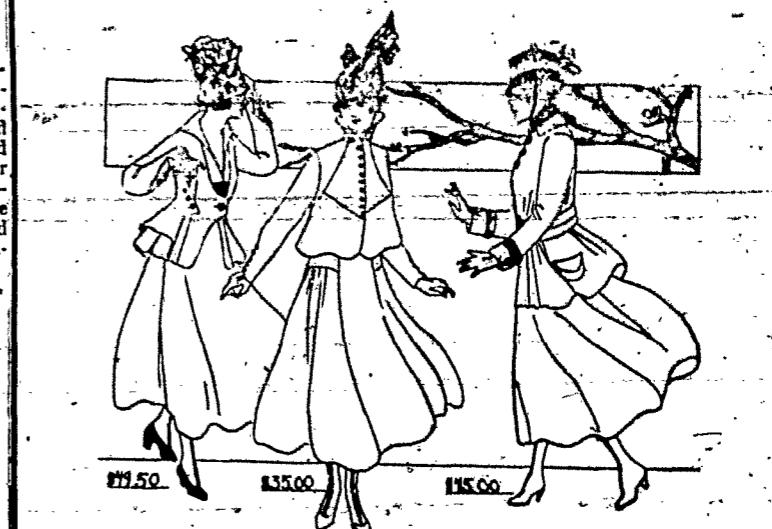
Drawn by the LuNette Artist for Models Selected at Random from Our Stock.

Suits, Coats, Dresses. LuNette SHOP For Women. Skirts, Blouses, Corsets. New Models in Tailored Suits